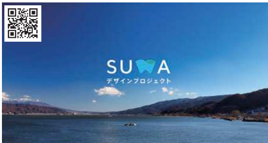
WEBサイトイメージ Website image

The site focuses on the skilled engineers, highlighting a history of fascinating product development and new business ventures.