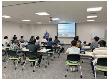
公立諏訪東京理科大ツアー Factory tours (A lot of curiosity among attendees arisen by the presentation)

The city is working to help them join companies operating here as their future employees through factory tours and presentations on the business activities provided by local manufacturers.