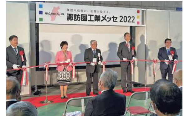
開会式 Opening ceremony

Reflecting the aforementioned theme, they are currently expanding their businesses into markets with eye-catching technologies in order to "Create Attractive Suwa Brand" that can meet customers' needs and wants.