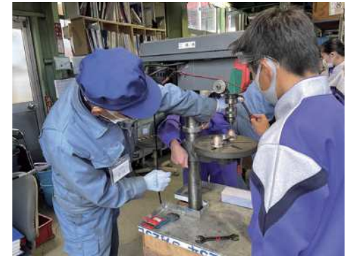
地域密着型ものづくり講座 Diligently attending the class with enjoyment

Company tours and hands-on classes at local companies as part of the program bring the joy and excitement of manufacturing to the students.