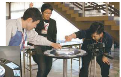
メッセ同時開催のコマ大戦 Sweat and tears: All-Japan Manufacturing Industry Koma Taisen (Spin Top Global Tournament) コマ大戦土俵 Dohyo, or competition ring